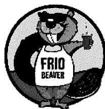
Frio River Grocery Logo Design

34. Defendant Austin Logo Designs maintains a website which includes the Beaver logo at issue and is as follows: